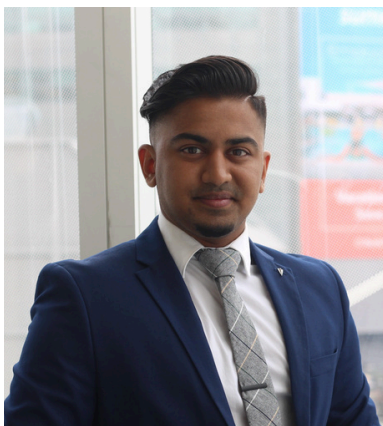
5th Year, Global Management Studies*