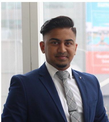
5th Year, Global Management Studies*