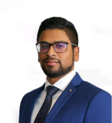
Data Analyst, Bank of Canada