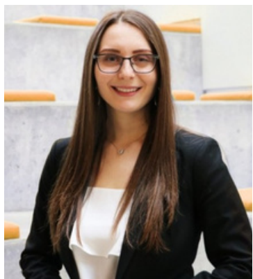
Data Analyst, Celestica