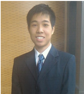
Compliance Officer, Senior Financial