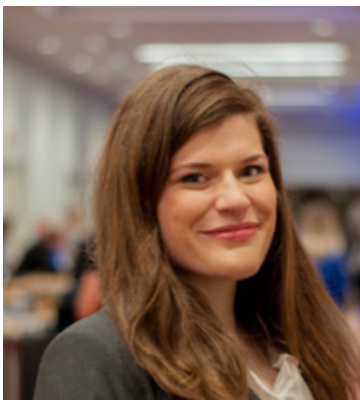
Senior Business Analyst, BMO