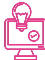
IT Business Solutions Consultant