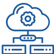
IT Infrastructure Planner