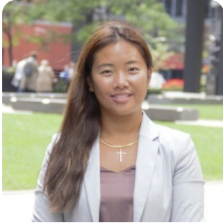
5th-Year REM Co-op Student