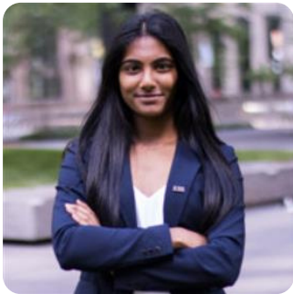
Real Estate Analyst, Deloitte