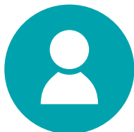
Income Tax Auditor