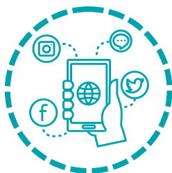
Leveraging Social Media

According to the Government of Canada's Job Bank, there will be a demand for Recruiters skilled in the utilization of social media. Being able to identify and hire strong candidates using social media is of interest to employers. Understanding how to use technology to recruit candidates remotely, and being able to pitch new strategies regarding hiring processes is now considered highly desirable 3 .