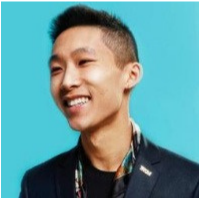
Unstoppable Domains RYANING