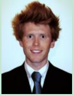
Julian House, SCI

I completed my undergraduate degree in Psychology (BA) at McMaster University and will now be pursuing my MA in Clinical Psychology. My area of interest is in Indigenous mental health including psychotherapies that can be used to most effectively treat Indigenous populations.